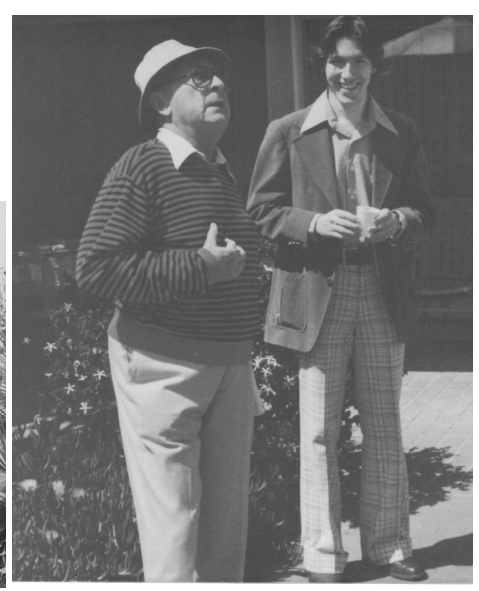
JH, holding forth with mock grandiloquence; please do not ask DM about outfit.