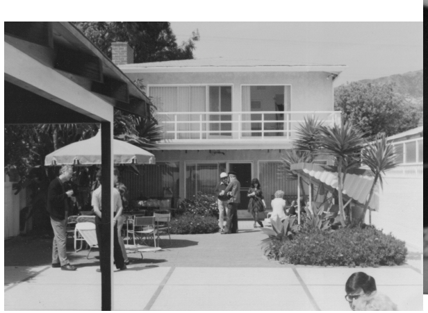
Malibu beach house; piñata hung from porch cover at left.